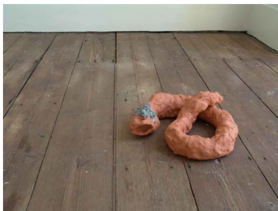
terracota and bitumen 12 cm x 34 cm x 35 cm