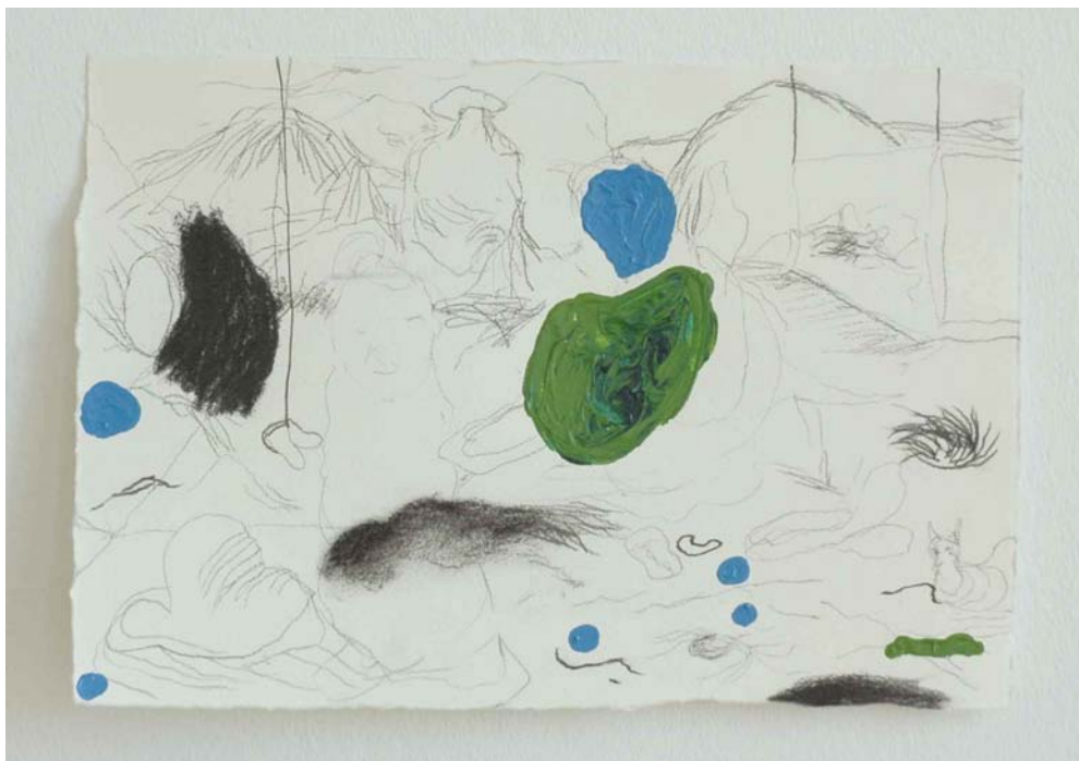
coal and acrylic on paper 27 cm x 39 cm