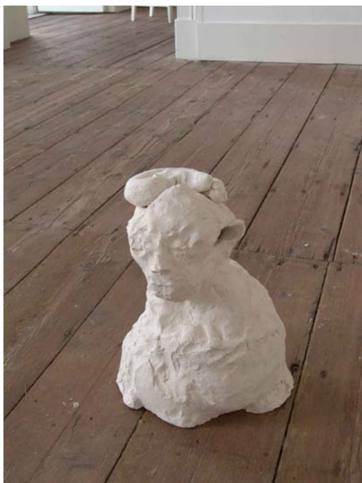
terracota 36 cm x 17 cm x 21 cm