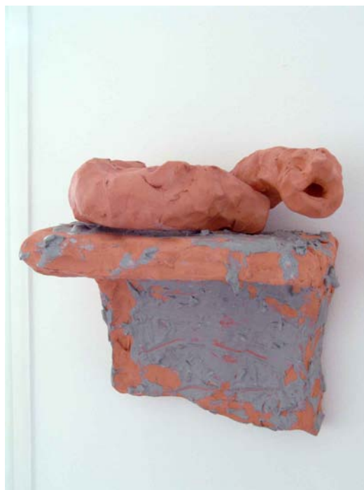
terracota 22 cm x 20,5 cm x 15 cm