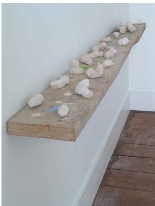
terracota, wood and ink 13 cm x 180,5 cm x 21 cm