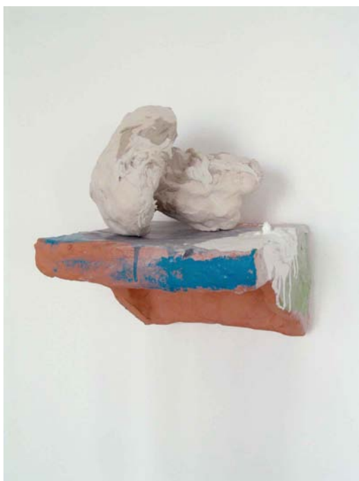
terracota, ink and bitumen 27 cm x 22 cm x 22,5 cm