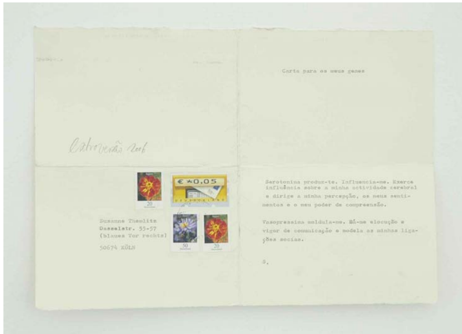
typed text, pencil, and stamps 20,5 cm x 29,5 cm