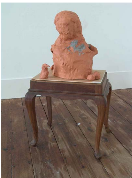
wooden table, terracota 83 cm x 48 cm x 37,5 cm