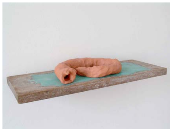
terracota, wood and silica 7 cm x 54,5 cm x 19,5 cm