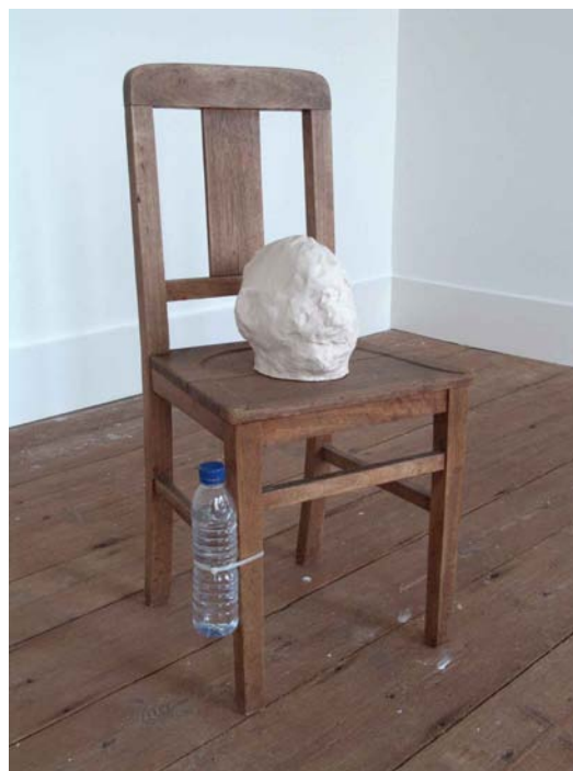
wooden chair, terracota 85,5 cm x 40 cm x 36 cm