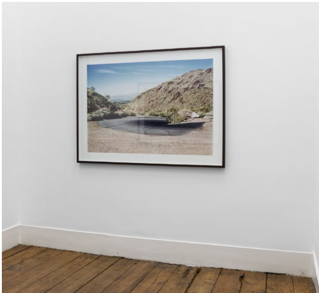
Untitled (Palm Springs) , 2011 C-Print Premium Luster Photo Paper 110 × 150 cm Edition of 3 + A.P.