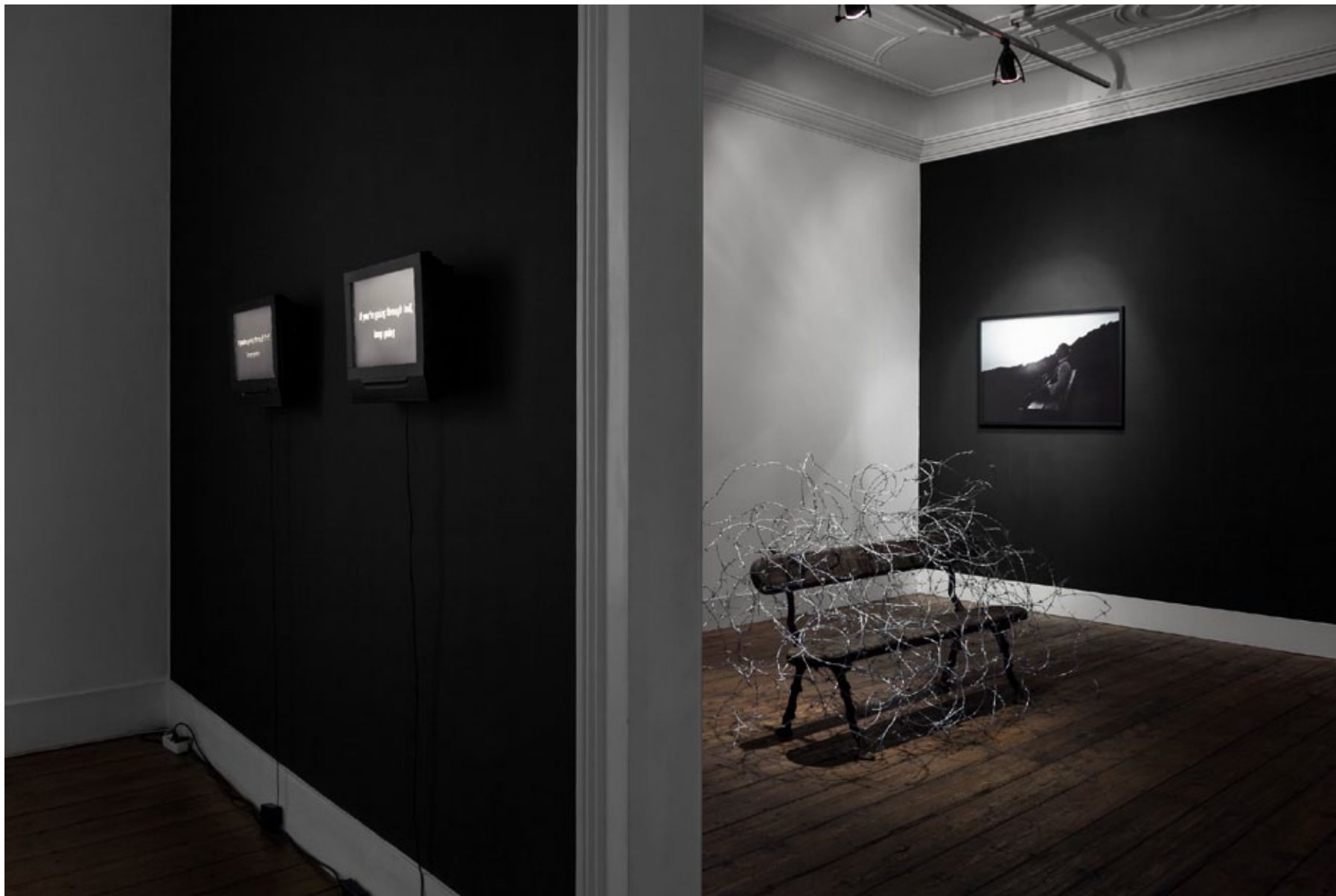
Vista da exposição: The American Sunset / Rui Calçada Bastos, Vera Cortês Art Agency, 2012 View of the exhibition: The American Sunset / Rui Calçada Bastos, Vera Cortês Art Agency, 2012