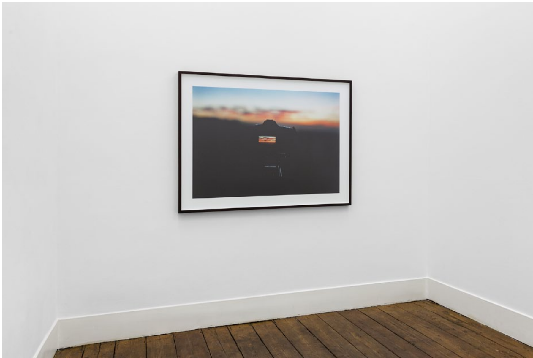
The American Sunset , 2011 C-Print Premium Luster Photo Paper 110 × 150 cm Edition of 3 + A.P.