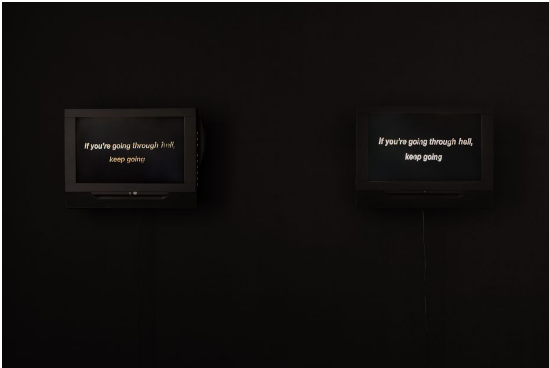
Night and day (night) / Night and day (day) , 2011 2 × (Video, Pal, 16:9. colour, sound. 13'06'') Edition of 5 + A.P.