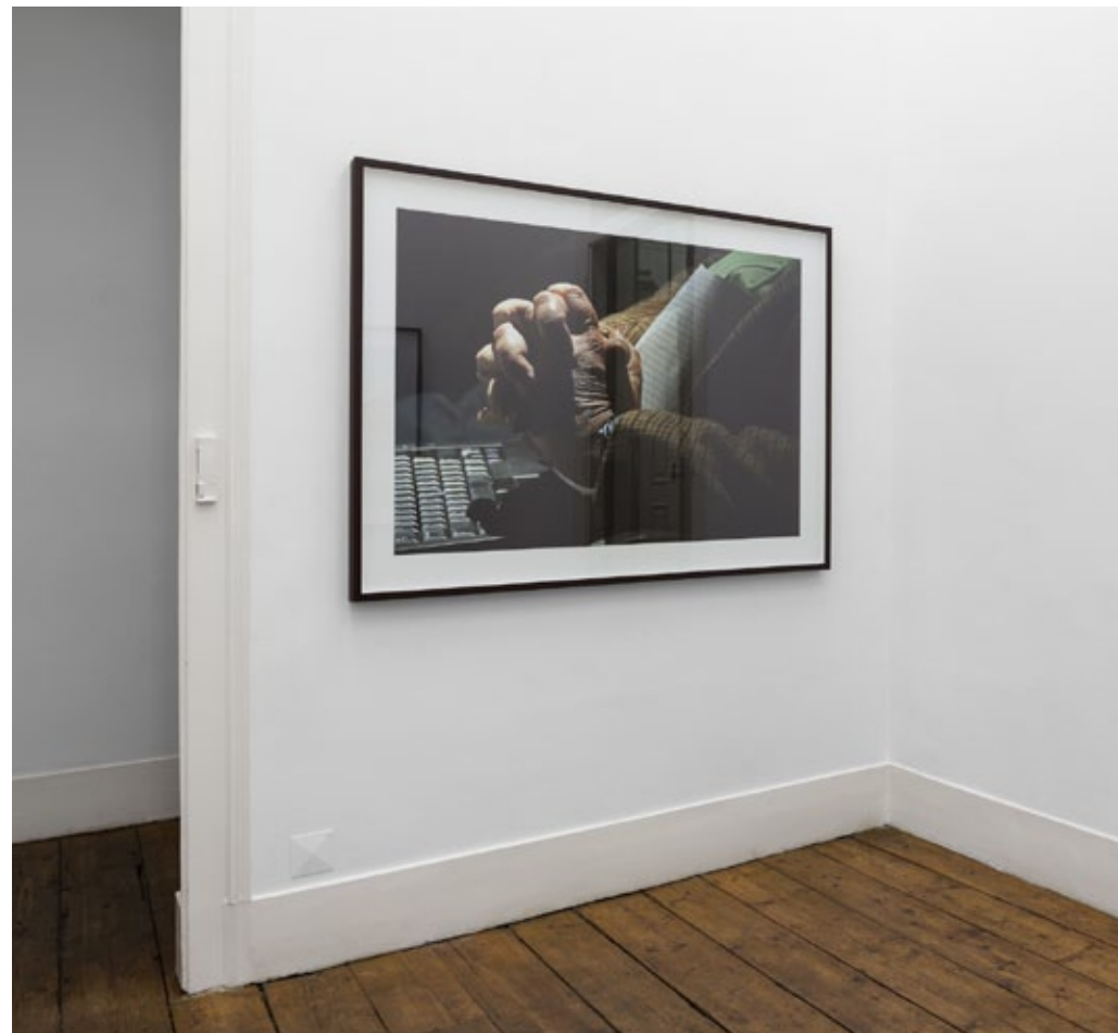
Untitled , 2011 C-Print Premium Luster Photo Paper 110 × 150 cm Edition of 3 + A.P.