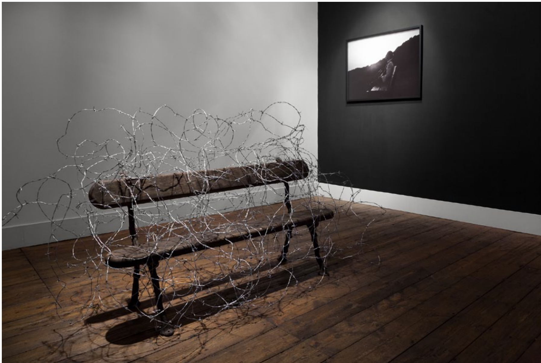
The American Sunset , 2011 Wooden bench, 150m of barbed wire Pigment Ink Print, Fine Art Baryta Paper 112 x 83 cm Edition of 3 + A.P.